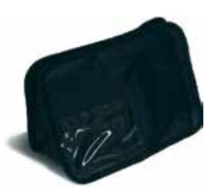
Navy Blue Zipper Bag