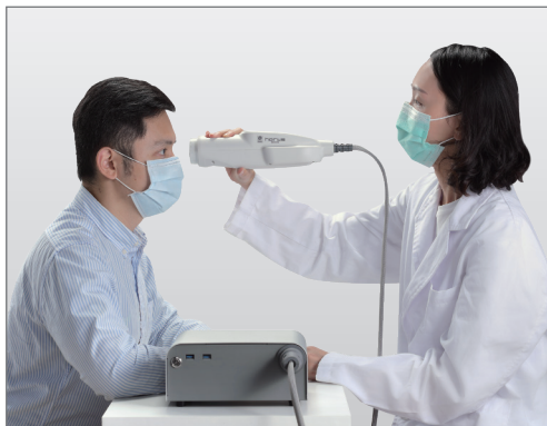
To combined with a 10.1" panel as a portable OCT