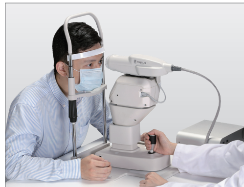
To integrate with the MiiS chin rest and an auto-aligning 3 axis module