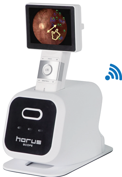
DSC 300 + DIB 100